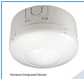
Variance Integrated Sensor